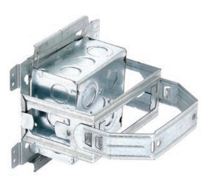
Assembled BB70 & BB70E