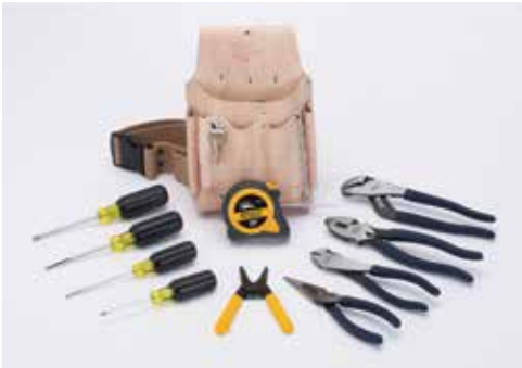
12-Piece Set 35-5805