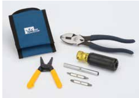
4-Piece Set 35-5799

See website or catalog for complete kit descriptions.