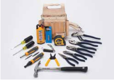
16-Piece Set 35-800