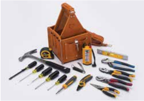
17-Piece Set 35-809