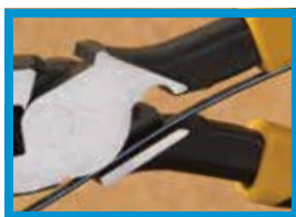
Fish tape puller