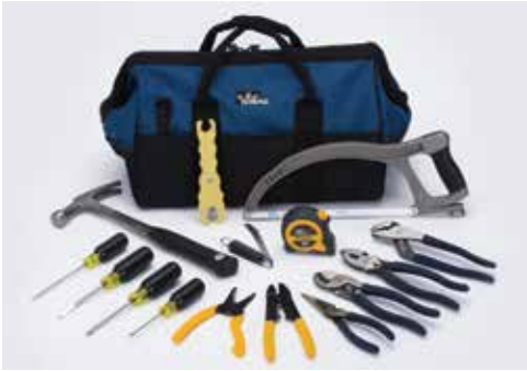
16-Piece Set 35-808