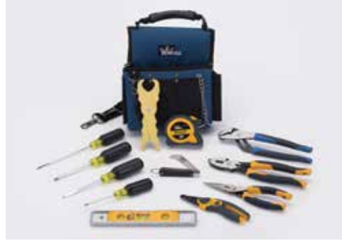
13-Piece Set 35-790