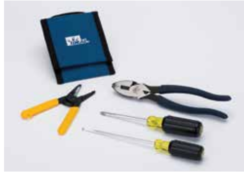
5-Piece Set 35-5792