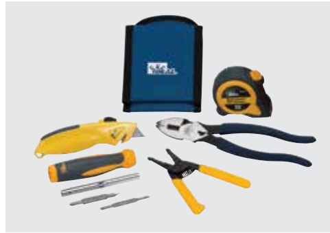
6-Piece Set 35-794